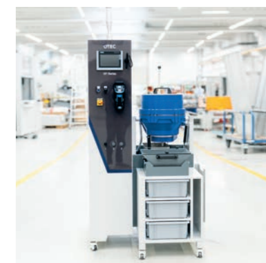
CF-Standard with one container