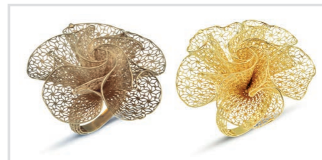
OTEC precision finishing solutions for the jewellery industry Jewellery expertise for high-gloss pieces

OTEC supplies more than just machines. Reproducible results that are a product of the technology, the abrasives, the carefully coordinated parameters and, most importantly, many years of process expertise. High-gloss finishes, cost-effective solutions and reliable processes based on advanced technology – OTEC is the expert partner you need for your surface finishing.