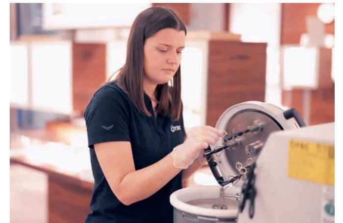
The pieces of jewellery are suspended from the holders