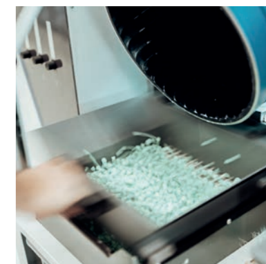
Reliable separation of workpieces