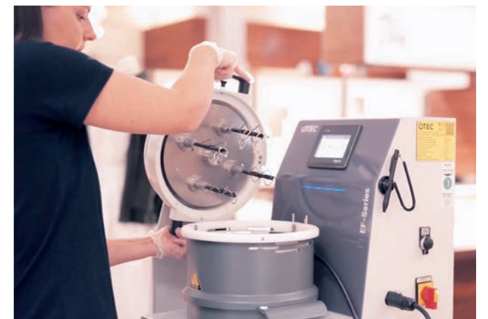
The lid is then attached to the container