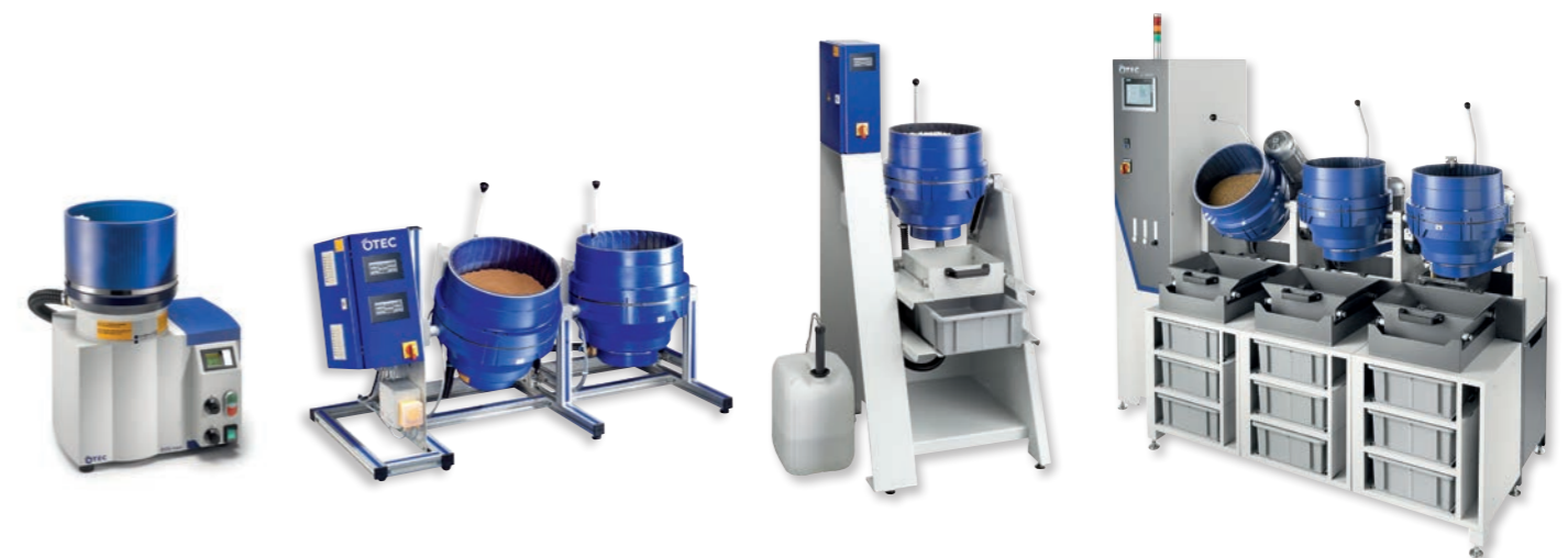
From left to right: Eco-Maxi | CF-T | CF-Element | CF-Standard

Benefit: Prevents the disc from becoming jammed or blocked, which ensures the reliability of the process and keeps maintenance to a minimum. This system is ideal for workpieces with a thickness of 0.7 mm or more.